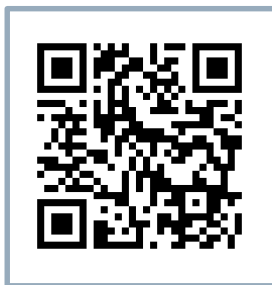
Application Form QR Code

*Participants will be required to purchase insurance in case of accidents during the internship.