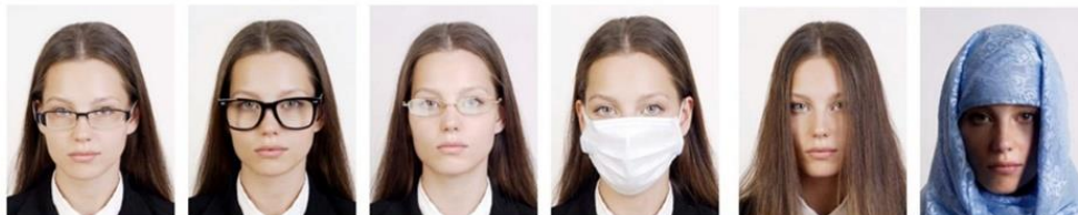
Glasses frame covers eyes

Photos in which part of the face is obscured