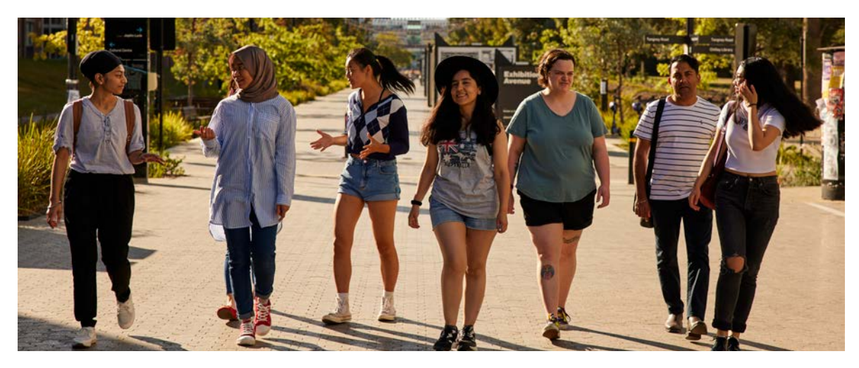
Global Programs undergraduate exchange & study abroad guide

anu.edu.au/study/apply/english-languagerequirements