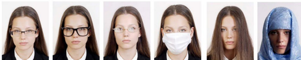
Glasses frame covers eyes Glasses frame is exceedingly large Lighting is reflected in glasses Part of face is covered with a mask Eyes are obscured by hair Cloth wrapping creates a shadow on face

Photos in which part of the face is obscured