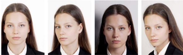
Off-center Face is angled to the side Shadow in background Body is angled

Photos that don't satisfy given measurements or specifications