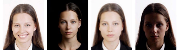
Expression differs greatly from normal expression Dark background color makes it difficult to determine outline Not clear due to focus issue or vibration of camera Shadow on face

Photos in which identification of the individual is difficult